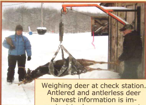
Weighing deer at check station. Antlered and antlerless deer harvest information is important to deer management.

Today, the KQDC offers hunters a place to harvest a nice buck or doe. It also has flocks of wild turkeys, numerous black bears, good squirrel hunting along with grouse and other small game in the wood harvest areas.