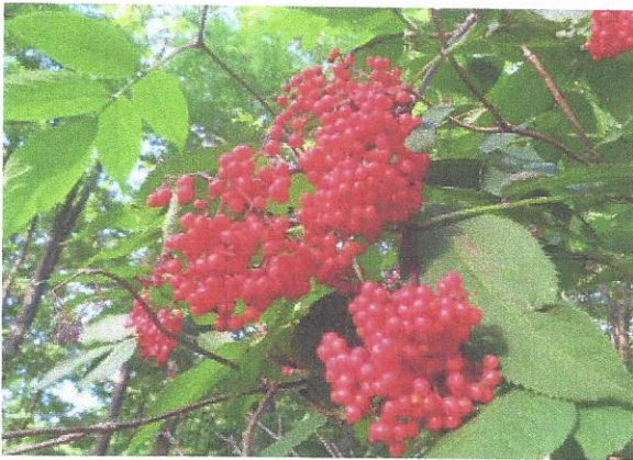
Red Berried Elder Fruit