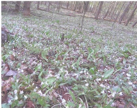
Millions of Spring beauties