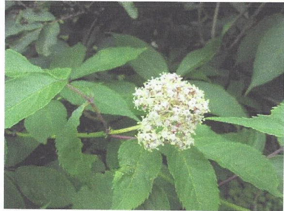
Red berried elder flowers in spring

SHADE TOLERANT SHRUBS LIKE THESE SHOULD BE FOUND BY THE THOUSANDS AND THOUSANDS THROUGHOUT THE KQDC. Others like alternate leaved dogwoods, American yews, rhododendrons, small hemlock seedlings and more should be much more plentiful than they are.