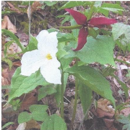
White Trillium and Purple Trillium

THESE SPRING WILDFLOWERS AND HUNDREDS MORE MAKE UP VITAL FOODS FOR DEER AND WILDLIFE IN PENNS WOODS