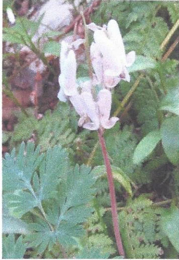
Squirrel corn in bloom