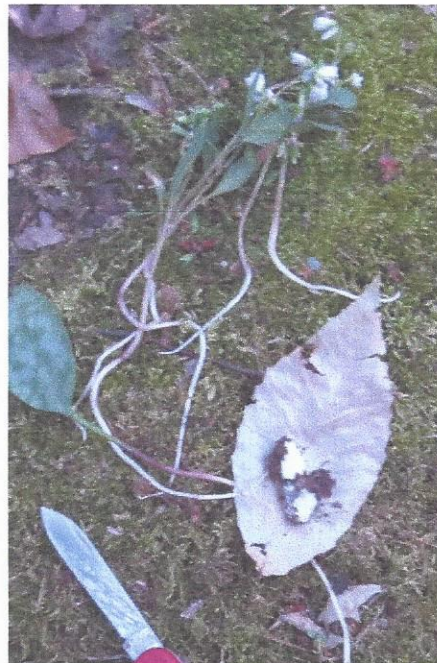
Tuber roots on spring beauties