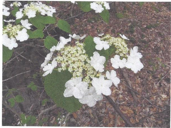
Hobblebush flowers in spring